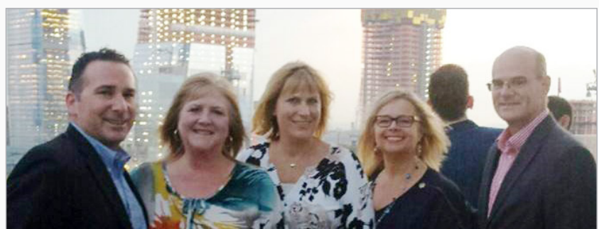
Above: ArrMaz Right: Team Tampa Bay

A number of private events provided unique opportunities to meet one on one with global site selectors and corporate real estate executives. Continuing with partnerships, the CFDC joined other economic development organizations in the region on a Team Tampa Bay mission to New York City to promote the many benefits of relocating and expanding business to Tampa Bay and Polk County. During the Select USA Conference in Washington, D.C., the CFDC staff met with companies from Poland, Germany, France, Canada, Romania and China in one-one-one, prearranged meetings.